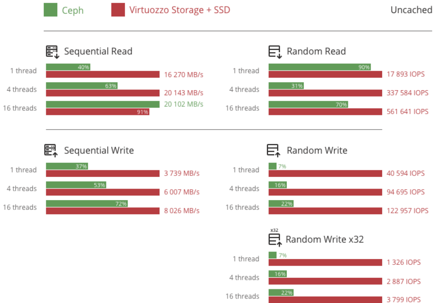
Figure 2: Virtuozzo Hybrid Server Storage vs Ceph